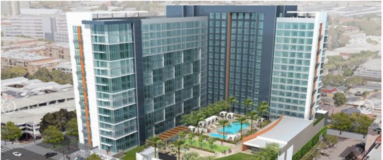
The Graduate student housing complex in downtown San Jose at 2 S. Second St., in a visualization. The soaring cost of construction could hobble efforts in San Jose and other Bay Area cities to speed development of high-density housing such as apartment towers, according to a forbidding assessment being circulated in the South Bay.

The soaring cost of construction could hobble efforts in San Jose and other Bay Area cities to speed development of high-density housing such as apartment towers, according to a forbidding assessment being circulated in the South Bay .